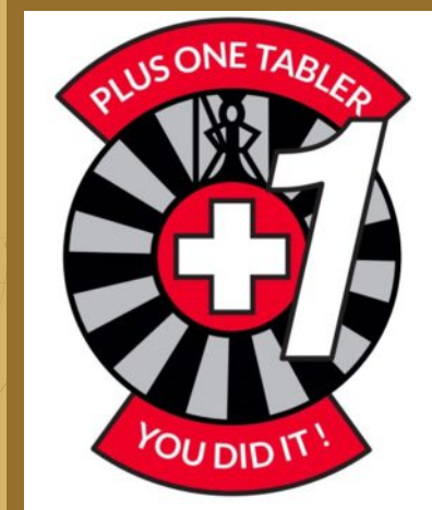
A special pin was given to all Tables that increased their club by at least one new member