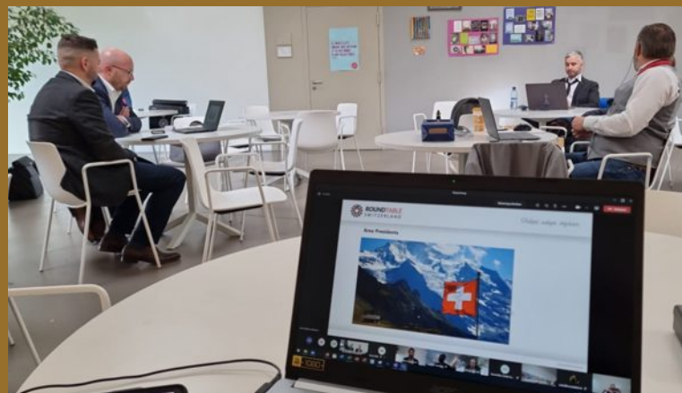
Hybrid Annual General Meeting