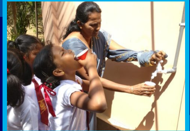
PROVIDING ACCESS TO CLEAN WATER - Provided clean water facilities to a rural school in SL