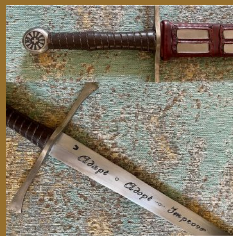
Sword of the "Swiss Tabler of the Year"