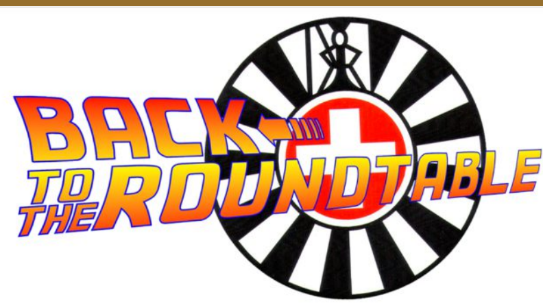
Our motto for 2021/22