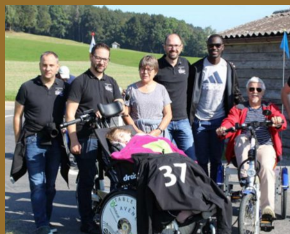
Award for Best Social Action went to RT37 Avanches