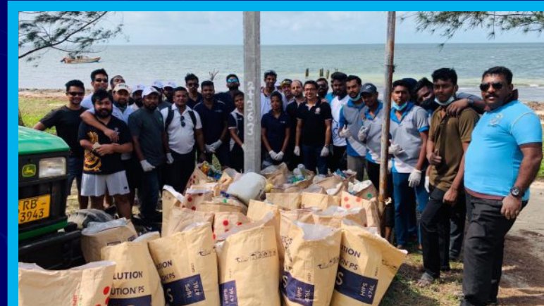
ISLAND-WIDE BEACH CLEAN-UPS - Covered 12 beaches covering 4 corners of the island