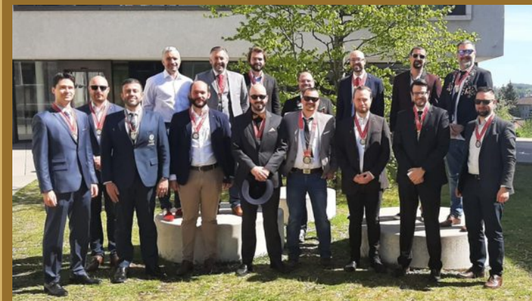
The new National Board of Switzerland