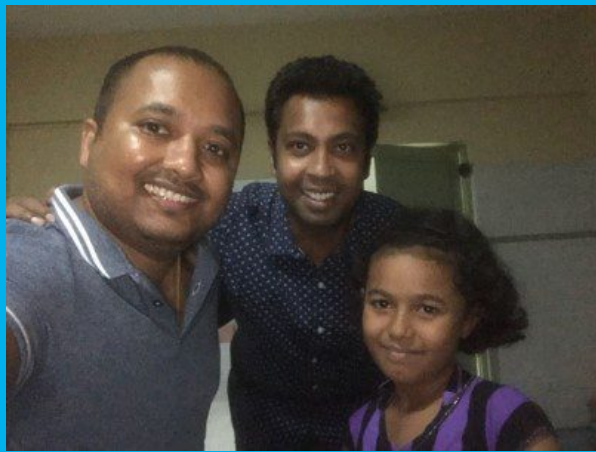
HEART SURGERIES - Conducted 12 heart surgeries during the year