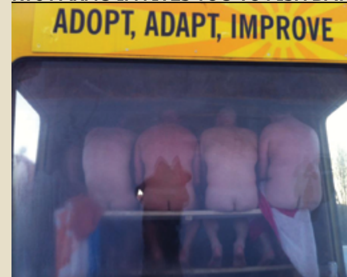
Fish Day, 26.-28. February 2016, Pärnu, Estonia

Fellow Tabler, did you know that every year in February there's all-day event in small country of Estonia that has entertained its guests more than 10 years? Probably no, but you should know that this event has been very popular among Estonian and foreign Tablers and Ladies. For example we have had guests from Germany, India, Great Britain and Norway, as well from our neighboring countries Latvia, Finland and Sweden.