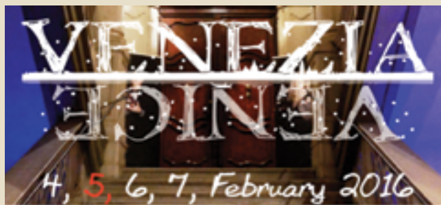
Round Table Venice International Carnival