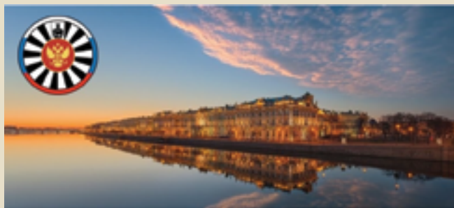
RT Russia re-charters from 3 - 6 March 2016