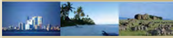
Dar es Salaam