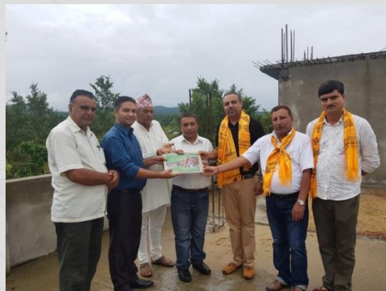
Signed Agreement between Round Table Nepal & Manaseva Ashram

“Together we can work for a happier Nepali society where people have a home to live, food to eat and no one feels deprived and misery”.