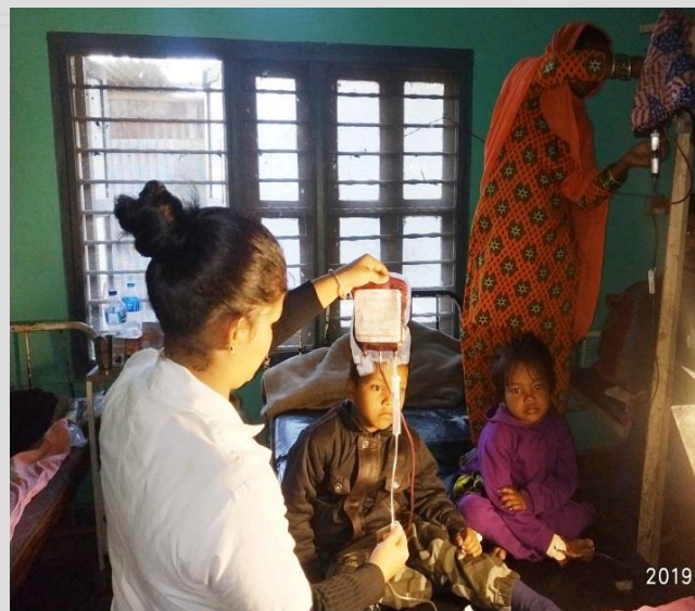
Blood Transfusion in process

We have spent about 5000 Euros and another 5000 has been budgeted for. We have been supporting 60 patients till date. Further we have estimated spending of 1500-2